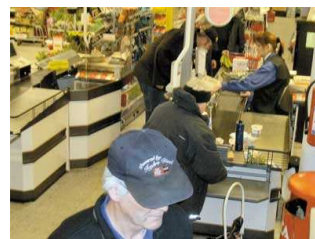
Traditional placement: camera height 2.5 m