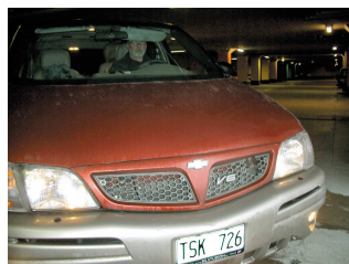
SmartWall: camera height 1.0 m