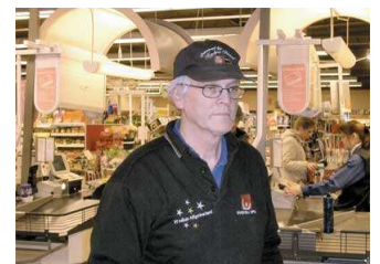
SmartWall: camera height 1.6 m