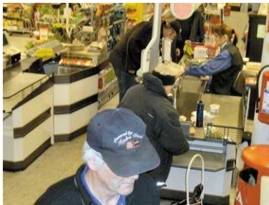
Traditional placement camera height 2.5 m