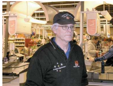
Electricity Box Camera camera height 1.6 m